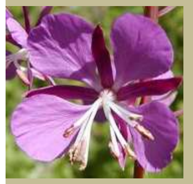
≻ Ovary inferior